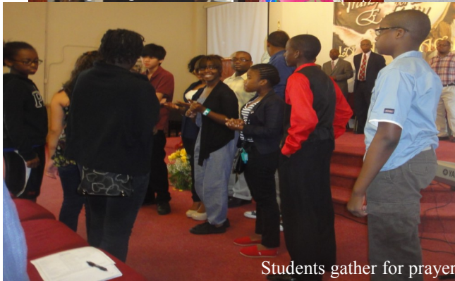
Students gather for prayer