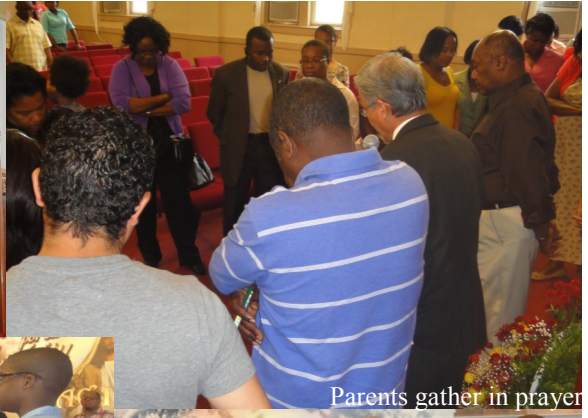
Parents gather in prayer