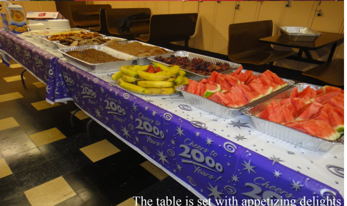
The table is set with appetizing delights