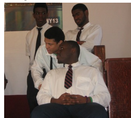
The Seniors encouraging the Juniors

The students who competed, got their chance to show their talents to the entire student body and faculty. We were pleased to see different