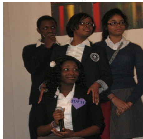
The sophomores waiting to answer their question

The spirit of competition was very evident among the direct competitors as well as their supporting classmates. Certain subjects were filled with intensity because the various students who went up to be questioned had retained a lot of knowledge over the school year. History was by far my favorite subject to watch because the freshmen and sophomores