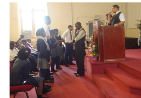
Students surrendering their lives to God

and He loves us very much. I encourage those in our school, especially the upper classmen, to step up to the plate, lead more