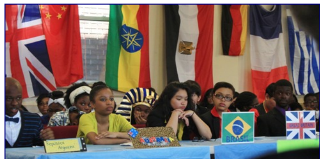
Delegates from Brazil, the United Kingdom and Argentina listen attentively as other delegates give their report

The Session began at about 10 a.m., and continued throughout the school day with an open invitation to all students, faculty and other members of the school staff to sit as spectators. Countries such as Canada, Argentina, England, and France discussed problems including pollution, child abuse, obesity, and poverty.