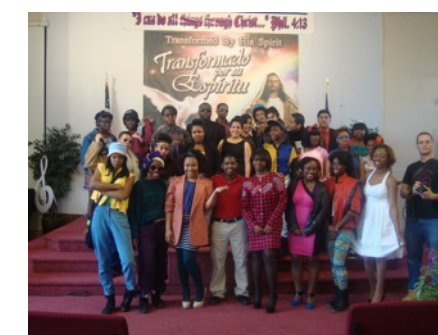
Spirit Week- Retro Day

Then next, we took a trip back in time to the “good old days.” This spectacular day was what I like to call “Retro Day.” Students took time to dig up