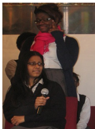
The Juniors happily answering their question

proved to be exemplary in this course. It is often said that competition brings out the worst in people, but at Greater New York Academy, the BOC competition proved to bring out the best in individuals. Each competing class demonstrated cooperation, team work, and an unquenchable zeal to win.