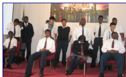
Students waiting to start BOTC

The annual competition known as Battle of the Classes: Academics (BOC) was held at Greater New York Academy of Seventh-day Adventists from May 7-11 of 2012. During this event four students from each grade level took a position on the